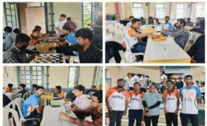
Inter College Chess Tournament