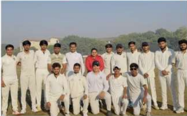
Inter College Cricket Tournament