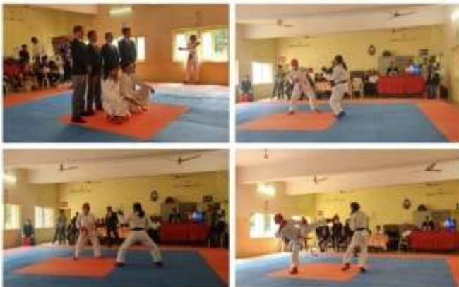
Inter College Karate Competition