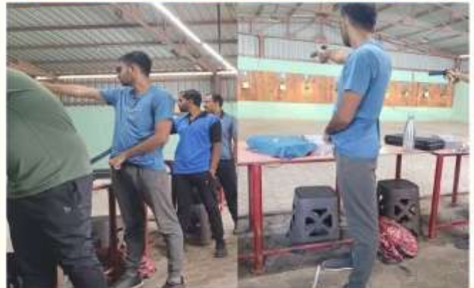
Inter College Pistol Shooting